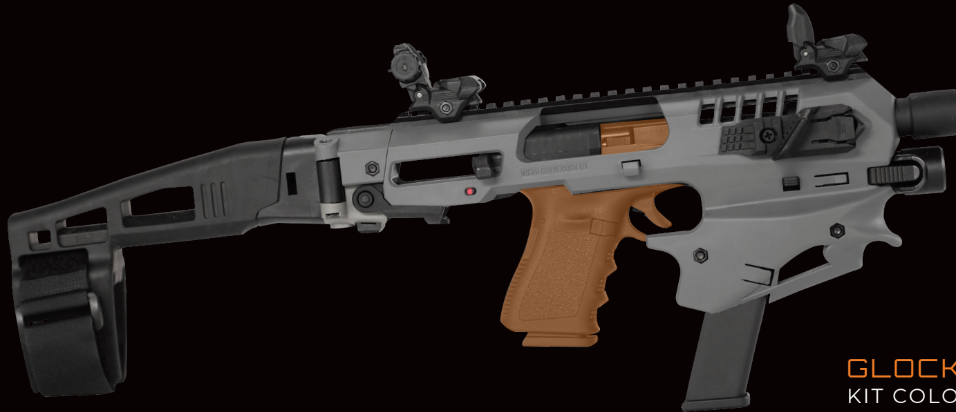
GLOCK | 17/19 KIT COLOR SHOWN: TUNGSTEN