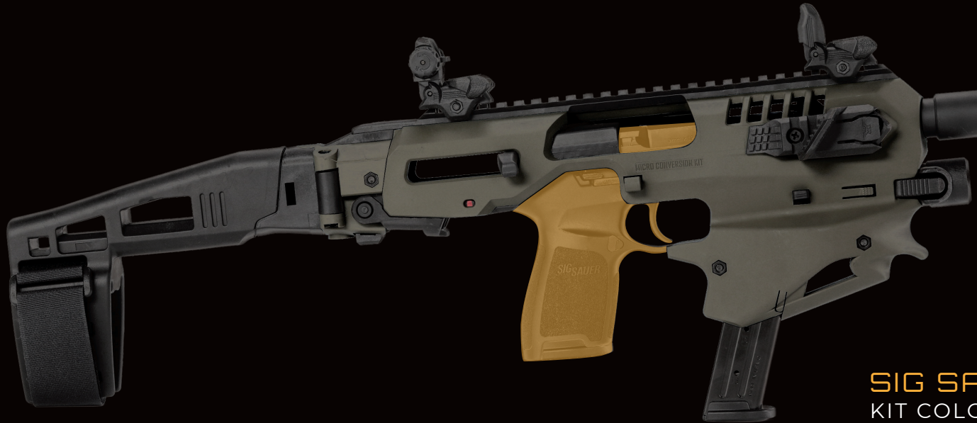
SIG SAUER P320 KIT COLOR SHOWN: ODG